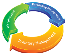
Supply Chain Management