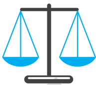
Customer Relationship Management